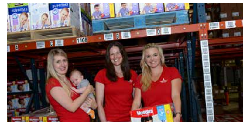
BEST FOOT FORWARD