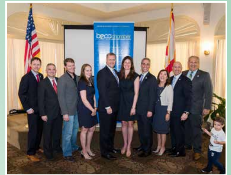
Public Affairs is one of the most rewarding and sought after placements in our league.