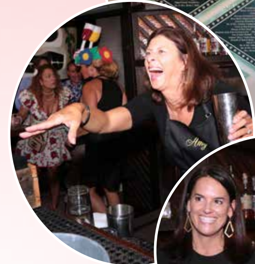
The Endowment board raised $25,000 at the Battle of the Bartenders, a bartending fundraiser held at Rocco's Tacos.