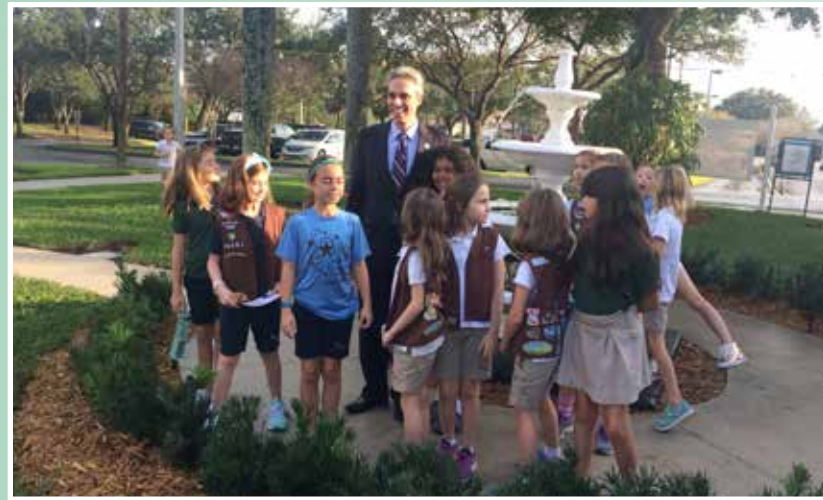
Our 2016-2017 State Public Affairs committee focused on health and hunger, including "at-risk" youth and education.