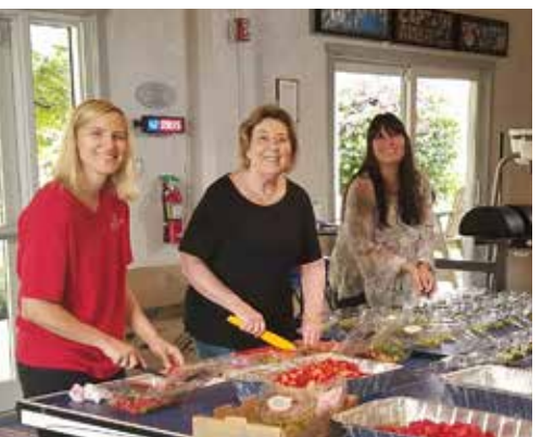
SOIL FOR THE SOUL