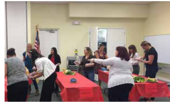
LOVE BOCA OUTREACH