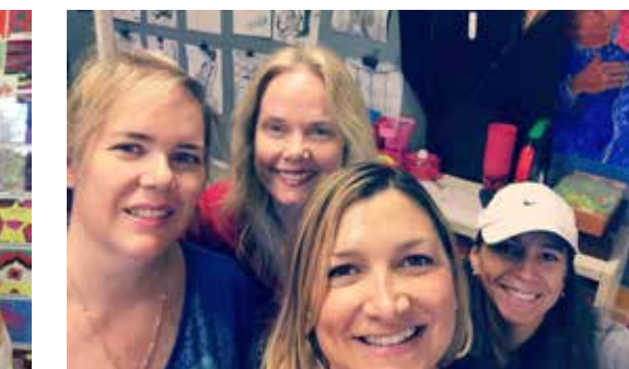
PLACE OF HOPE COOKING CLASS