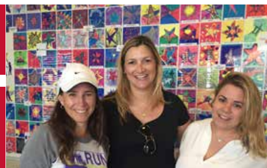
BOCA HELPING HANDS