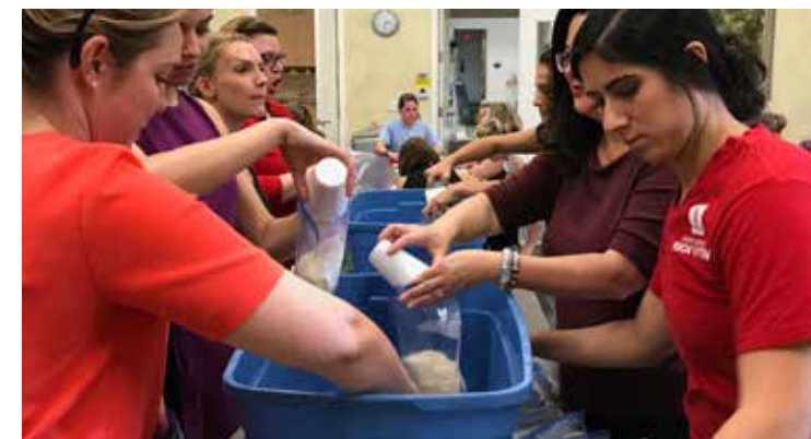
AMERICAN ASSOCIATION OF CAREGIVING YOUTH